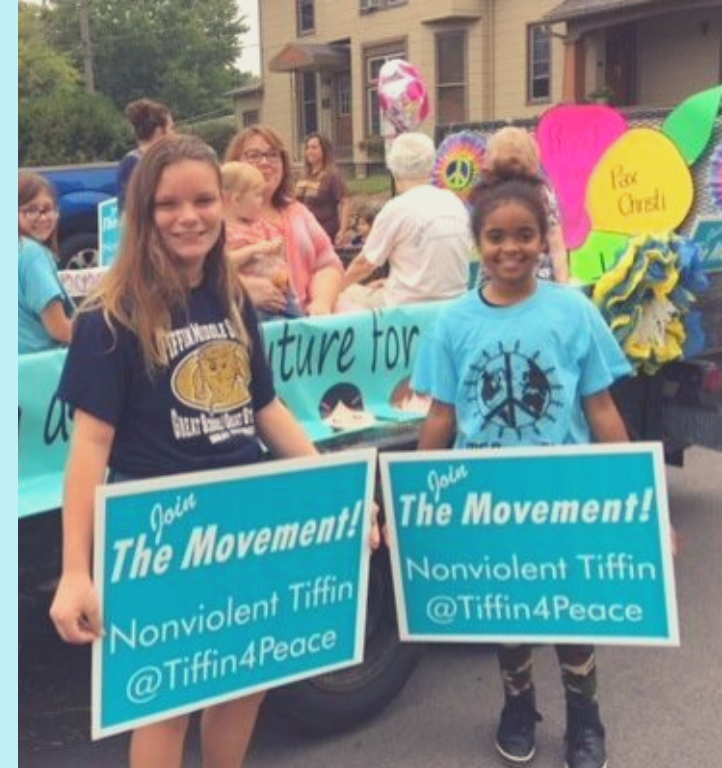
Tiffin Middle School students march in the Heritage Parade.

Find us on Facebook Nonviolent Tiffin @Tiffin4Peace