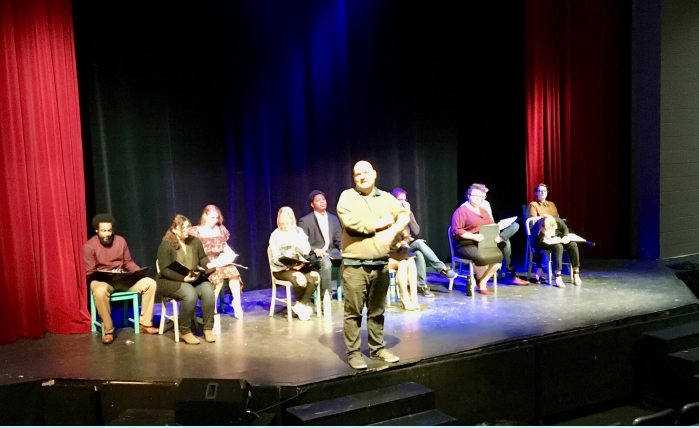
Heidelberg drama students dramatize stories of personal struggle.