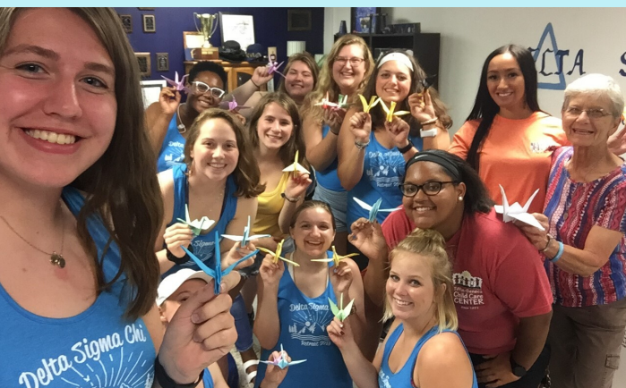
Delta Sigma Chi members and their peace crane creations