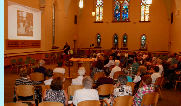
Dorothy Day scholar and author speaks to Tiffin area people.