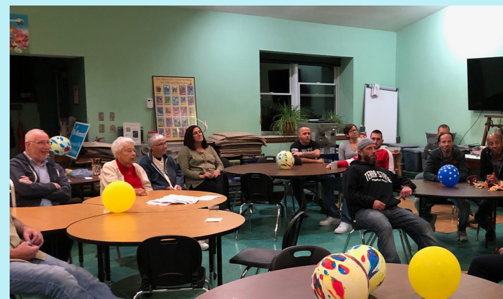
Tiffin community shares with CROSSWAEH residents.