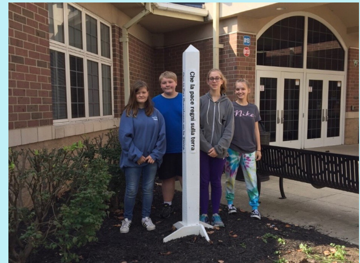
Member of the Peace Club at Tiffin Middle School with their Peace Pole